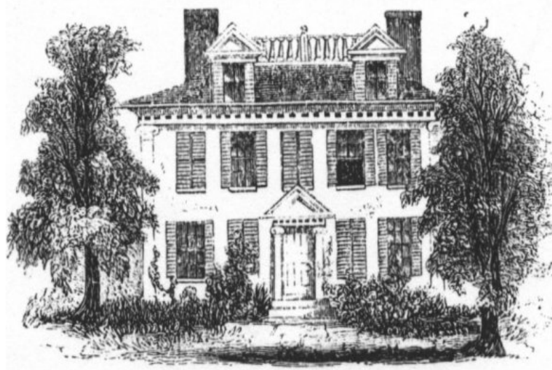
THE RIEDESEL HOUSE, CAMBRIDGE.

Charlotte, the children, and their servants were with the army through the campaign toward Saratoga. Though inevitably living more comfortably than the privates, they endured the same rough food and weather. She did not hesitate to help with the wounded and the dead.