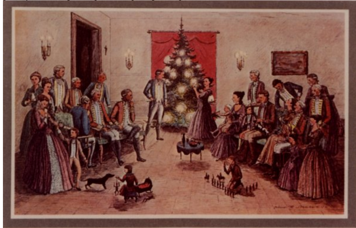
Die Einführung des ersten Weihnachtsbaumes in Kanada durch General Riedesel Freiherr zu Eisenbach, Weihnachten 1781.

By being returned to British-controlled New York, the General was free to resume a military role. Promoted to Lieutenant General in 1781, he was placed in command of forces around New York City and Long Island. The family settled briefly into a house in Brooklyn along the Hudson River. This proved to be a hazardous location due to regular raids by the Americans, so the entire family moved back to Canada. The General's job was to organize the German troops there. Charlotte set up housekeeping at Sorel in Quebec, and this was to be their home for two more years. He saw no more military action. It was during this final sojourn in Canada that the General is credited with introducing the custom of the Christmas tree to North America as portrayed in this painting. The original painting is in the Governor's Museum in Sorel, Quebec.