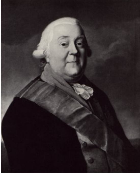
General F. A. Riedesel FzE (1738-1800)

General Riedesel is without question the best-known member of his lineage, and certainly so among the Americans with whom he shares his last name though no blood kinship. Almost as well-known is his wife, who was born Luise Charlotte von Massow. Her written observations of their experiences during the American Revolution were published in both German and, later, English.