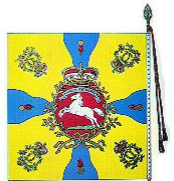
Battle flag of the Brunswick infantry regiment commanded by General Riedesel

Charlotte's journey to and stay in England were costly and frustrating. She spoke no English and was not there in any official capacity such that government would offer help. Finally, she was taken under the wing of an officer who had known her husband during the Seven Years War. This led eventually to an introduction to the King and Queen who marveled at her courage. After