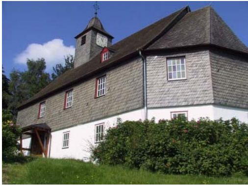
Church in Wunderthausen

fields are scattered in all directions. In summer months, cattle had to be led to pasture daily, and that land was often an hour or two away from the village. Its population during the period of emigration was around 450-500.