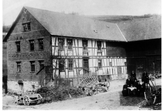
Weymers house in Wunderthausen about 1906.

The emigration of this Riedesel family completed a process that unfolded over half a century in which well over 100 sons and daughters of tiny Wunderthausen came to call Wheatland home. They represented over two dozen of the houses in Wunderthausen. The intricate family connections between them are no surprise at all, given that the marriages in the village were usually endogenous, and given the phenomenon of chain migration.