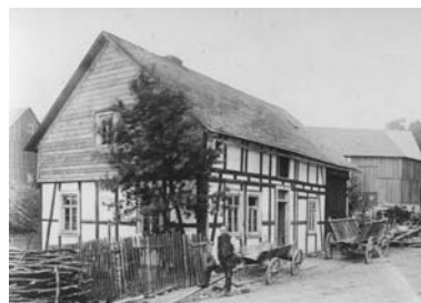
Haase Haus in Wunderthausen