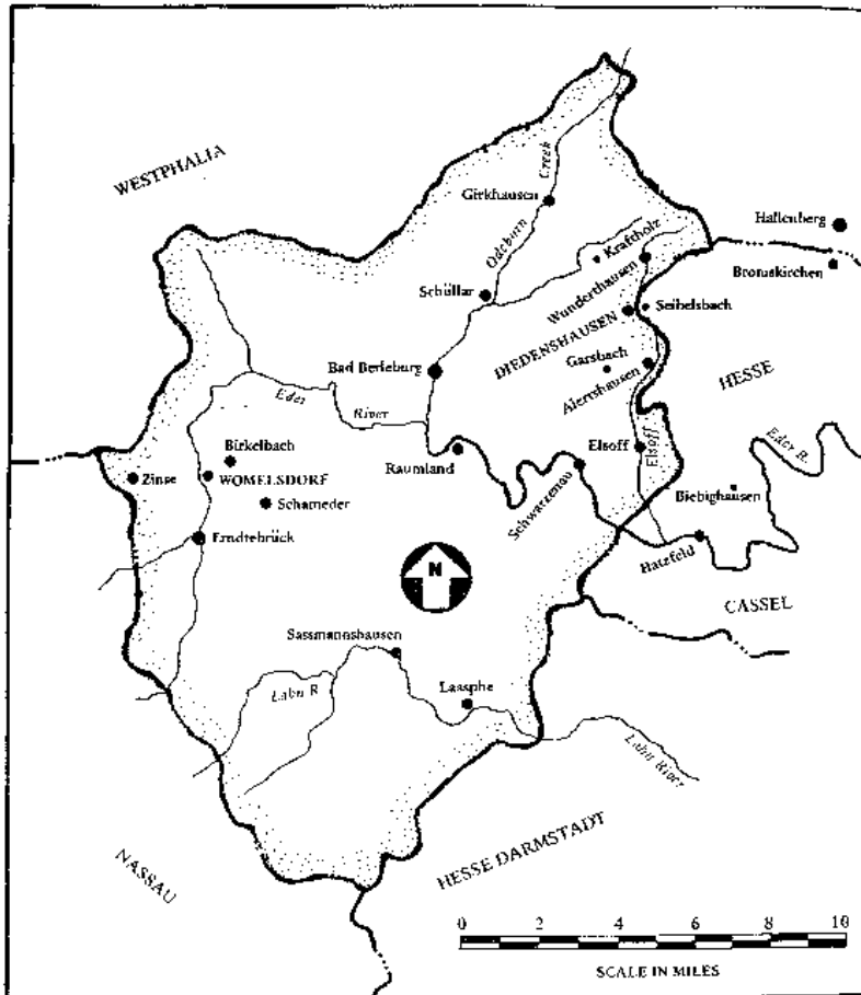
The County (Grafschaft) of Wittgenstein in 1648 showing neighboring states. Cologne (Köln) is roughly 70 miles to the west and Frankfurt is about the same distance to the south and east.

Napoleon Bonaparte had taken control of Wittgenstein, along with the Rhineland, in the early 1800s. The Napoleonic order came to an end with the defeat of the French at Waterloo in 1815. The victorious powers took the opportunity to reorganize what had been a hodge-podge of over 300 minor German states, cities, sovereign bishoprics, etc. into a few larger states. It was the fate of Wittgenstein to become subject to the great military power of Prussia.